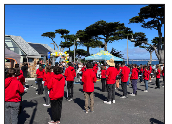
The Breaker Band performs at the grand opening of California Seltzer Co., a new restaurant and seltzery at Lovers Point, on September 17.