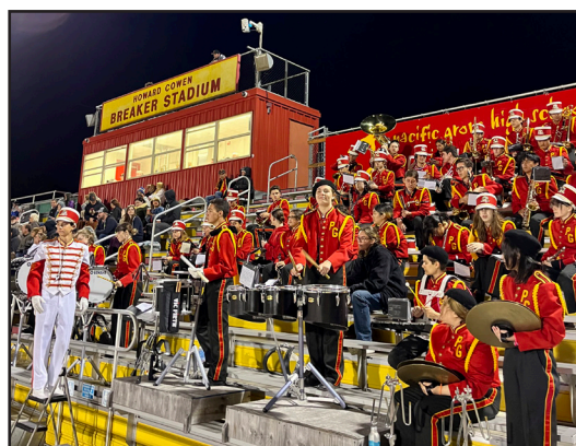
The Breaker Band in its section of the stands at Breaker Stadium, featuring a new sign.