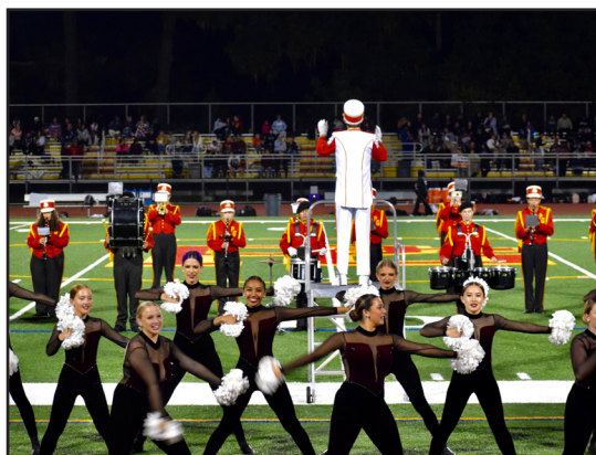
The Breaker Band performs a field show as the Breaker Girls dance during halftime of a home football game.

The latest performance was at the Butterfly Parade, where the band played the march King Cotton by John Philip Sousa and a mix of drumline cadences. After the band finished their marching, they performed a six-song set on the Robert Down field, consisting of music from prior football games, for the crowd. These performances all went very well for the band, and they have many more in store for the rest of the year.