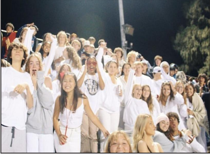
The student section dressed up for the white out theme.

The student section makes Friday night football games so much fun, and it is amazing to see all the students supporting our team while dressing up for the various themes. This week was a bye week, but make sure to dress up for the next theme, and cheer on our team!