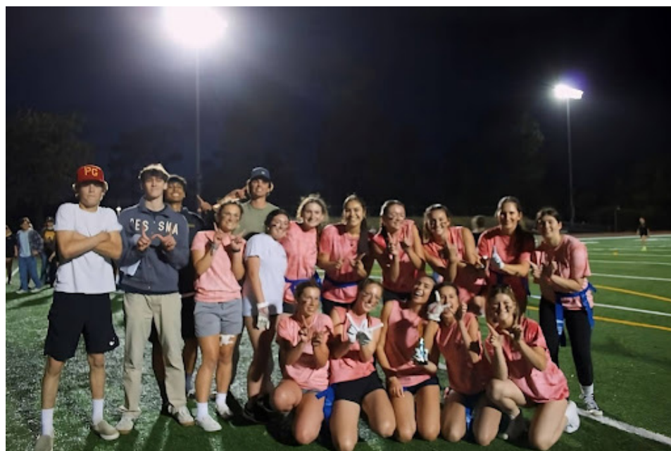
The junior powderpuff team celebrate their victory.

While the team did not end with perfect results, they made great progress and are hoping to come back stronger and ready to play next year.