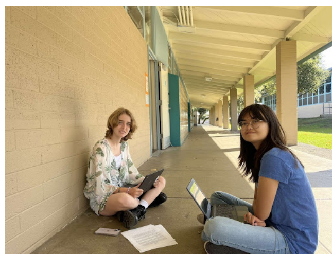
#School Culture and Community