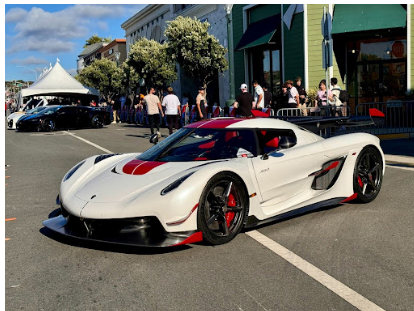
1/28 at this time Koenigsegg Jesko Attack at Exotics on Broadway in Seaside ($3,000,000)

A tragic car crash on August 19, 2024 caused a horrible accident, where the 1979 Ford Ghia Probe 1 Concept Car valued at approximately $1,000,000 was left engulfed in flames after being in a trailer headed home on Highway 1. Monterey Car Week always brings thrills, and this year did not disappoint!